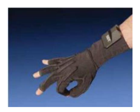
Fig.2: Glove based approach.

between the interaction of computer and the user as shown in Fig. 2. The price of this instrumented glove is quite high and is inefficient for working in virtual reality [5] [6] [7].