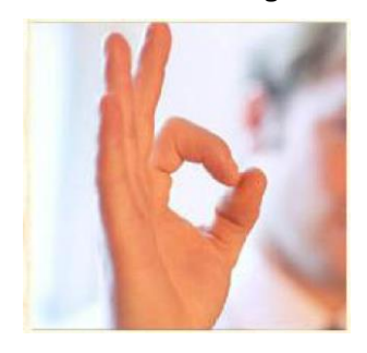
Fig.1: Vision based Hand Gesture.

In this type of approach the system requires only camera to capture images required for the interaction between human and computers and no extra device is needed as shown in Fig-1. Although this approach is simple but a lot of challenges rose such as the complex background, lightning variation and other skin colour objects with the hand objects. Beside this system requires various measurements such as velocity, recognition time, robustness and computational efficiency [4][5].