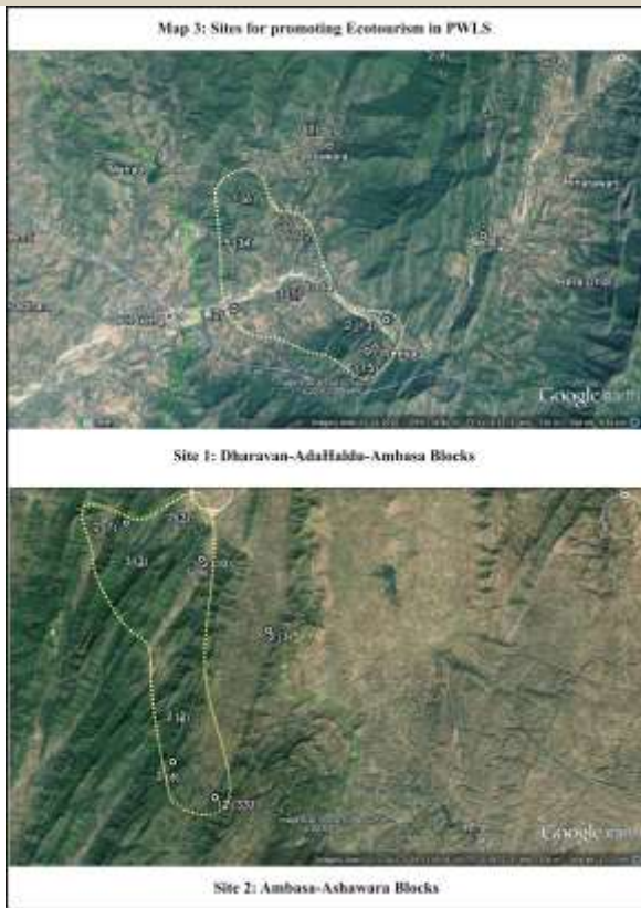
Map 3: Sites for Promoting Ecotourism in PWLS.