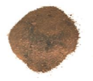
Fig. 1: Solid pyrolysis product after ashing.

SPP treated with "dry" ashing is a dark brown powder [Fig. 1].