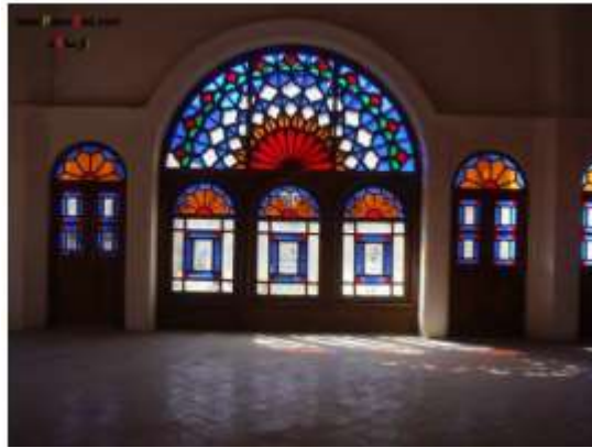
Figure (10): Sash window, source: the author