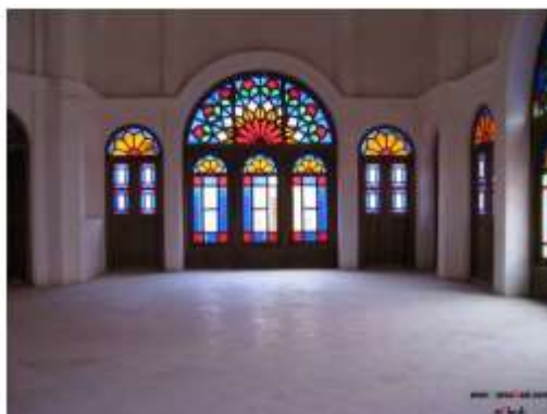
Figure (3): Tabataba'ees' House, source: the author

Sharden, the French voyager, travelled to Iran in Safavid era and meanwhile writing expositions about the houses and their decorations states that “the windows for the ordinary people’s homes are made of sycamore tree wood but the windows for the aristocrats and the noblemen’s homes is made of lattice-like wooden frames in each of the lattices there is installed and inserted a colorful small glass and these as a whole give birth to a beautiful figure... their window frames is either installed with glass or transparent plasters which also have beautiful shapes and figures carved on them and at the same time they let a lot of light to be passing through (5).