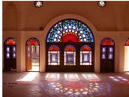
Figure (13): Tabataba'ees' House sash window

This multifunctional window serves as a light reflector which radiates the colors on various surfaces and also causes the users' spirit to enhance under various circumstances besides softening of the colors and getting them entered to the interior spaces of the building. The sash windows surface was used to be ornamented and decorated with the use of different and variegated carvings of Girih tiles and with colorful and simply plain glasses and by doing so innovative combinations are resulted and this way the disharmony between the geometrical lattice-like structures and the colorful lights generate a sort of agreeable beauty. Proportionate workings between the sash window (light geometrical order) and the color, as proposed by Ibn Heytham, are the two of the three superior elements which seem to be possessing the greatest capability in creating visual aesthetic effects and they are intensively dependent on the third element which is the light and the light is the ultimate source of the visual beauty which is the prerequisite for the individual to be able to see and also it has been expressed by him that the color per se can add another beauty to the light beauty and prettiness.