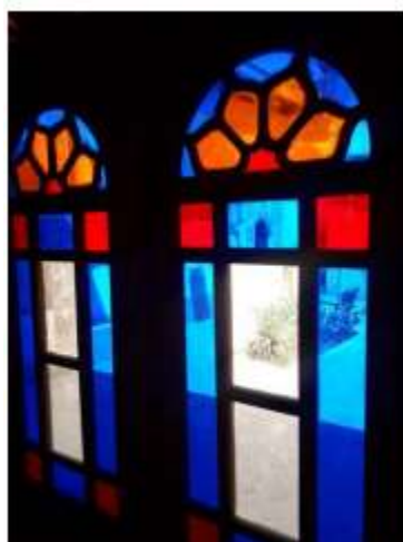
Figure (9): Sash window

spirit and the otherwise can also be held true. Maybe you have had experiences of how the insufficient lighting has adversely and unpleasantly influenced your feelings when making use of a space. For instance, the rooms facing the sun tend to take in greater light and provide the residents with pleasant, warm and happy spaces which cause them to feel agreeable. This is while the rooms which are exposed to direct sun light tend to have tiring, dull and cold spaces and cause the residents to feel depression and nostalgia. On sunny days during which the sunlight creates black and white visual effects the individuals turn out to be more active and energetic. Conversely, on misty and cloudy days when there is no black and white effect present the space looks stagnant, dull and boring. The differences between the two days can be found out in the quality of light (14) (figure 9).