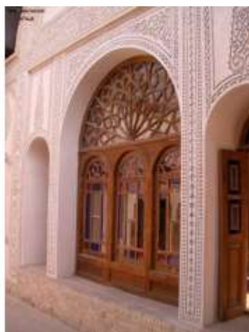
Figure (8): Tabataba'ees' House sash window, source: Isfahan cultural heritage office

Light is an active factor in introducing the space. Also the light is capable of giving the space a visual expansion. It is the primary condition for visual perceptions. In the absolute darkness we cannot see the space nor the forms or the shapes. But, the light is not the only physical necessity; rather it is more of a psychological value which makes it one of the most important factors of life in every respect. The way the objects are manifested in contrast with the light makes them more highlighted or less highlighted.