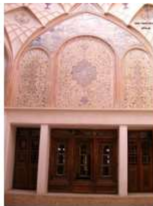
Figure (12): sash window

In hot and dry climates, the sun radiation angle is too much and the number of the sunny days is too many, to prevent from the too much sun to enter and cause too much heat the opening sections aspects should be made as small as possible and the elevations from the ground level should be heightened. But such a solution does not seem to provide sufficient light for carrying out the routine activities. The Iranian architect transfers a sufficient amount of light to the interior of the building through the use of sash window and by taking advantage of beautiful Girih tiles and by making use of the sun light fractionation and also by taking advantage of the wood which possesses a low heat transfer coefficient the amount and the intensity of the heat transfer is reduced (18) (figure 12).