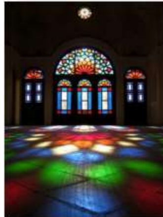
Figure 7: sash window, source: Isfahan cultural heritage

The effect of the colors used in Tabataba'ees' House sash window on the individuals has been illustrated in table 4.