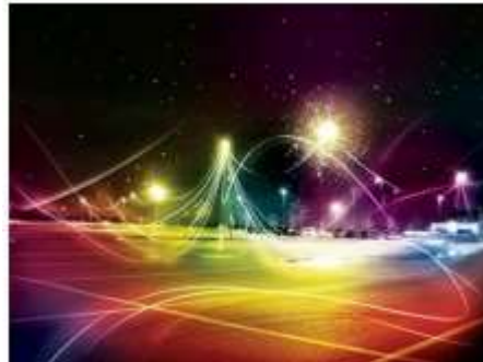
Figure (6): the color effect on the human environments, source: (7)

The color is a strong factor which can be stimulating or tranquilizing, cause a feeling of coldness or warmness and make a person irritated or joyful. The colors favored by the individuals can reveal numerous secrets about them. Experiencing the color energies emitted by different colors can explicitly exert a visual-sensational effect on us. Colors can revolutionarily change our periphery and they can increase our creativities, By the help of the colors, an individual can bring about the conditions for elevating his or her self-awareness and be changed to a lively and active human being (figure 6).